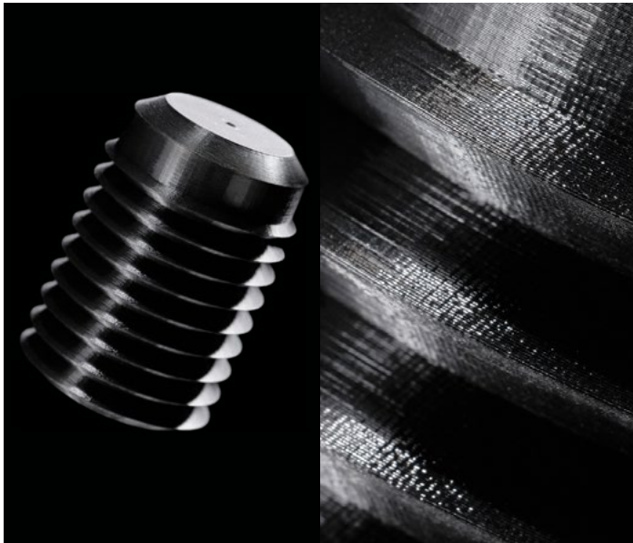
S-TPU in Black